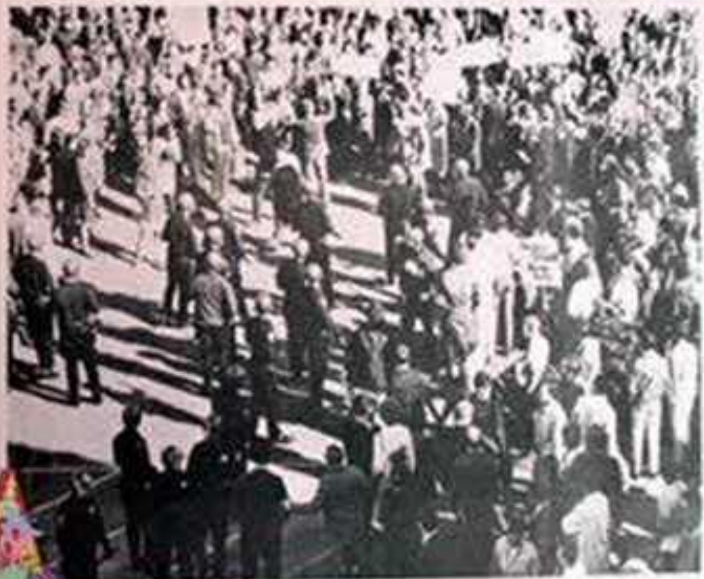
Faculty protest on public ground, 1968.